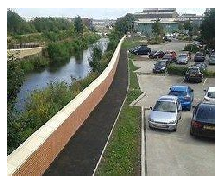
It is this flood defence that caused most of the damage in Fishlake, but some of the water came from the Ochre Dyke.

"Last year, as you will be aware, our village suffered devastating flooding in November 2019. Having studied geography, ecology and agriculture at the Universities of Nottingham, Oxford and Lincoln respectively, I am familiar with environmental issues including flood risk, catchment-based solutions and climate change. When buying a house in Fishlake in March 2019 we therefore paid close attention to the EA's long term flood risk assessment for Fishlake - which at the time was very low risk - prior to our home purchase in March 2019."